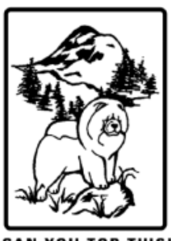
CAN YOU TOP THIS